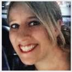
Jacqueline Ryan NY Fashion Examiner

See also: fashion news , fashion trends , beauty trends 2015 , fall colors , what to wear , beauty news and trends